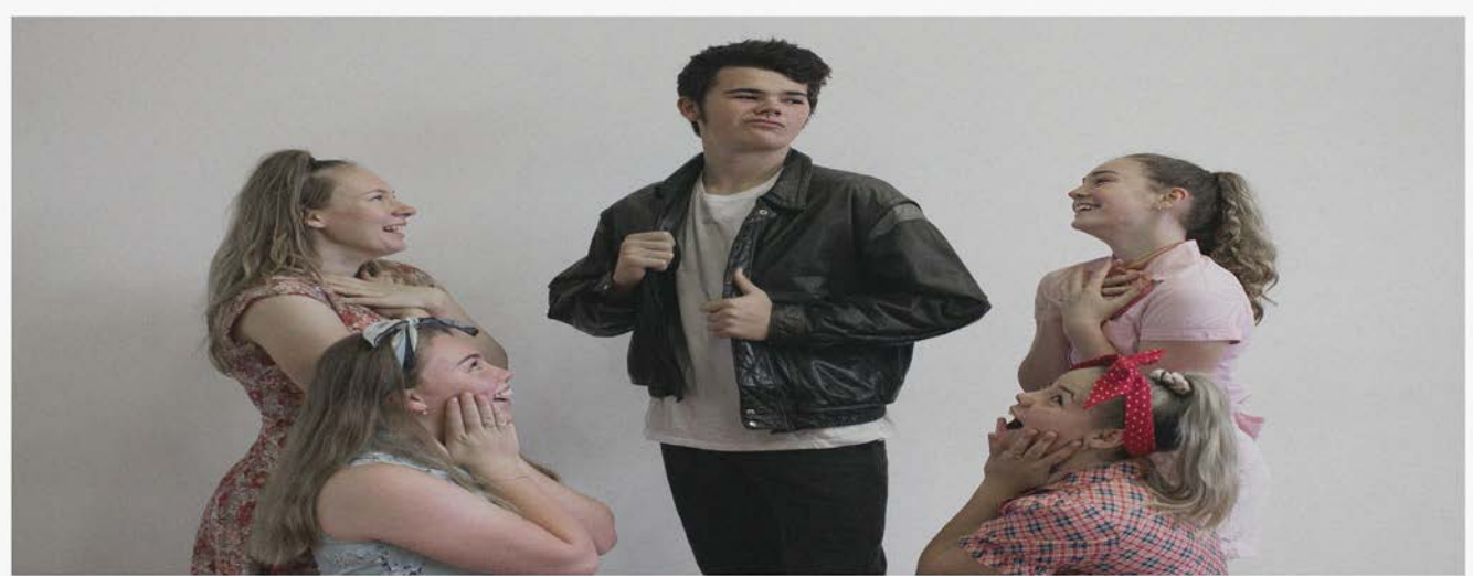
Respect Responsibility Relationships Resilience Realising Potential